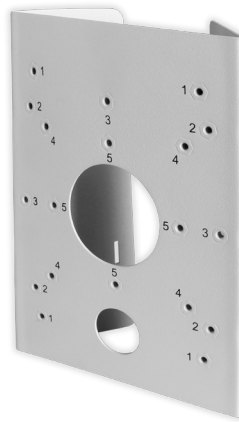
New universal DWC-PMB-WLW hardware