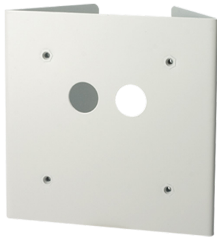
Old DWC-PMB-WLW hardware

The optimized universal DWC-PMB-WLW hardware now supports multiple products and will replace all other current pole mounts. The new hardware will include numbered mounting points, each number compatible with different wall mounts and junction boxes. Refer to the table below for supported products.